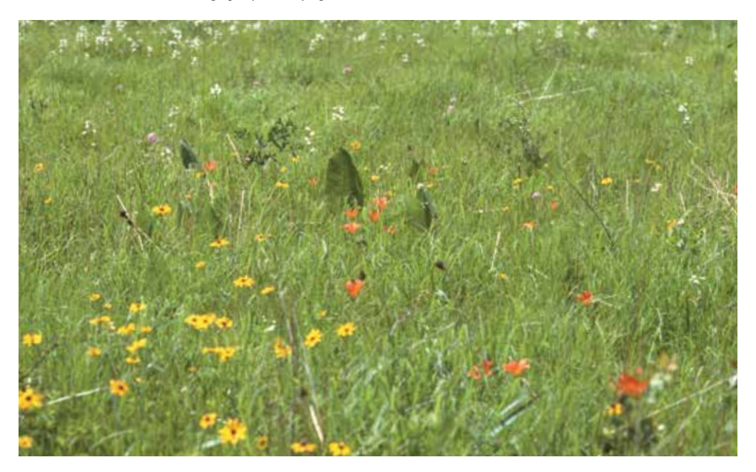
Historic Greene Prairie restoration, UW Arboretum.