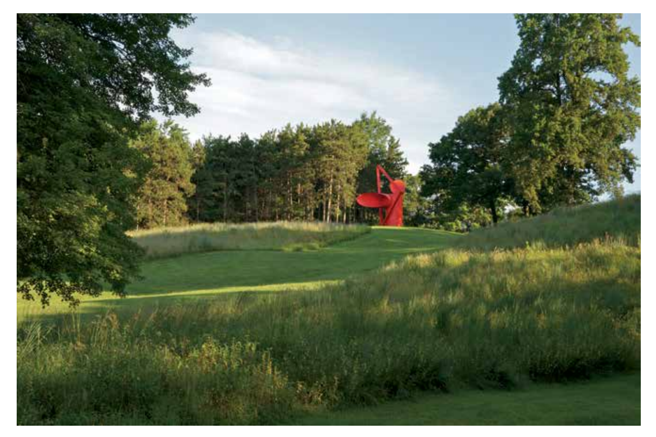
Islands of big bluestem, Canada wildrye, and Indiangrass with Alexander Liberman's Adam (1970), Storm King Art Center. © 2020 The Alexander Liberman Trust. Photograph by Jerry L. Thompson. Courtesy Storm King Art Center.

left, Tal Streeter's playful red vertical zigzag Endless Column . I continued on as the driveway curved up Museum Hill, with a fifty-year-old planting of pines with pole-like trunks on my right, and Kenneth Snelson's Free Ride Home , a composition of aluminum tubes with stainless steel cable, down a slope to my left. At the top of the hill, I arrived at a Normandy-style chateau built in 1935, now both a museum and the administrative building for the art center.