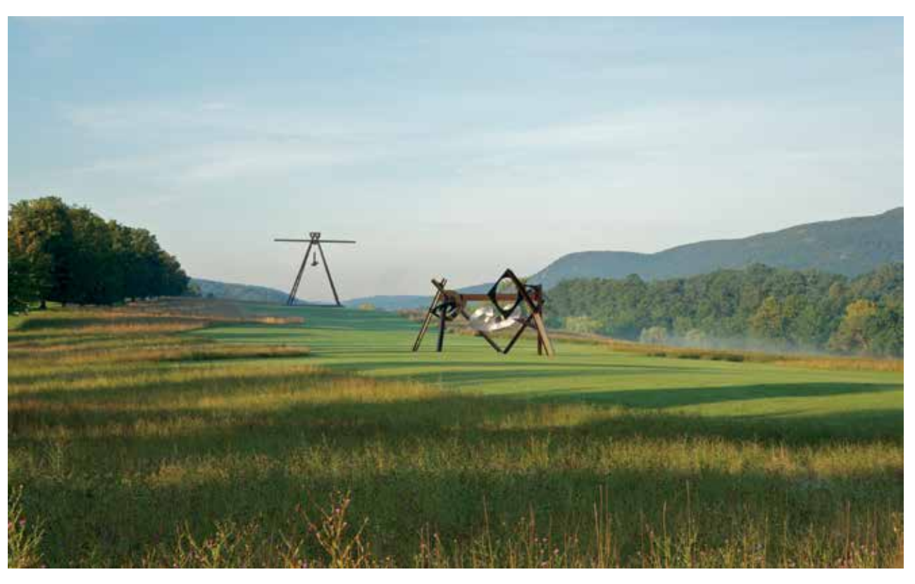
Peninsulas of native grasses in South Fields with Mark di Suvero's Pyramidian (1987/1998) and Beethoven's Quartet (2003), Storm King Art Center. Pyramidian , gift of the Ralph E. Odgen Foundation; Beethoven's Quartet , courtesy Tippet Rise Art Center. © Mark di Suvero, courtesy the artist and Spacetime C.C.

On our initial tour of the site that day, I noted that non-native weed species thrived in all sunny areas that were not regularly mowed. We would be fighting a battle with spotted knapweed in dry areas and purple loosestrife in wet, poorly drained ones. From my experience on the farm, I knew that weeds seemed to be suppressed in areas planted in the perennial forage crop, alfalfa, for two or more years. Instead of plunging into a program of planting native grass mixes the next spring, I recommended seeding cover crops as "placeholders," and native grasses later. In spring 1997, upland sites would be