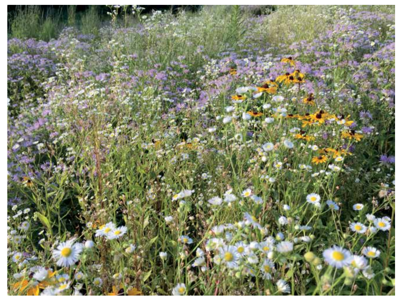
Early-successional species: daisy fleabane, wild bergamot, and black-eyed Susan, Round House.

Neither of us is enamored with cultivars of native species and we agree