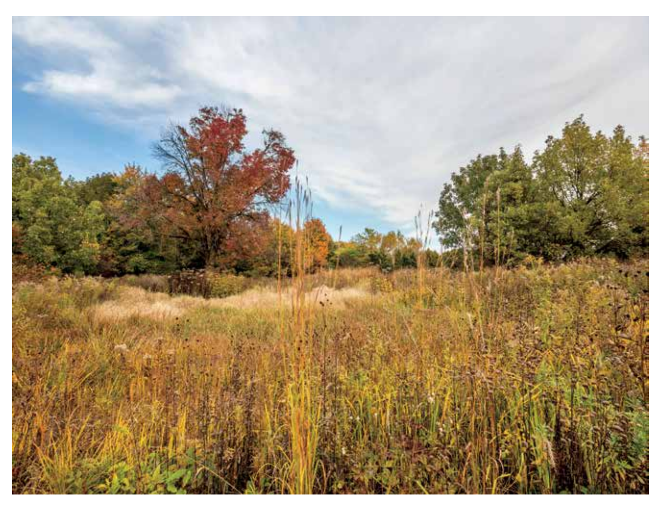
Long prairie vista with bluejoint grass in the wetland area, Native Plant Garden, UW Arboretum.

ciation process was not present. That year, I kept in touch with a realtor who was on the lookout for land that might interest me. After locating many properties with deal-breaking drawbacks, she finally sent photos of a twenty-acre parcel that seemed promising. Sixteen acres of the site were occupied by a rich hardwood forest on a steep north-facing slope, which extended over a ridge and partway down a south-facing slope, where paper birches and scattered red cedars feathered into a rocky dry prairie. As I studied the photographs from faraway Georgia, it was apparent that this was a high-quality natural prairie remnant with all the "right" colors of little bluestem, side-oats grama grass, northern prairie dropseed, and Indiangrass. Once again, I was seduced