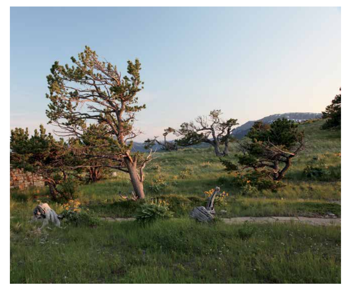
Limber pines, balsamroot, and native grasses near the guesthouse, Montana ranch.

placing colored flags through the clumps of pines, alternately in the open, then enclosed in a small pine grove, and then out into the open again. Sunlight and shadow, prospect and refuge. The curves in the narrow path are not broad, river-like curves but those of a winding stream. There is a bit of mystery where low-branched pines partially block the view and then open up to reveal bluegray mountain peaks on the distant horizon. Next, a rustic circular wall is revealed, a council ring, twelve feet in diameter with a three-foot-wide entrance