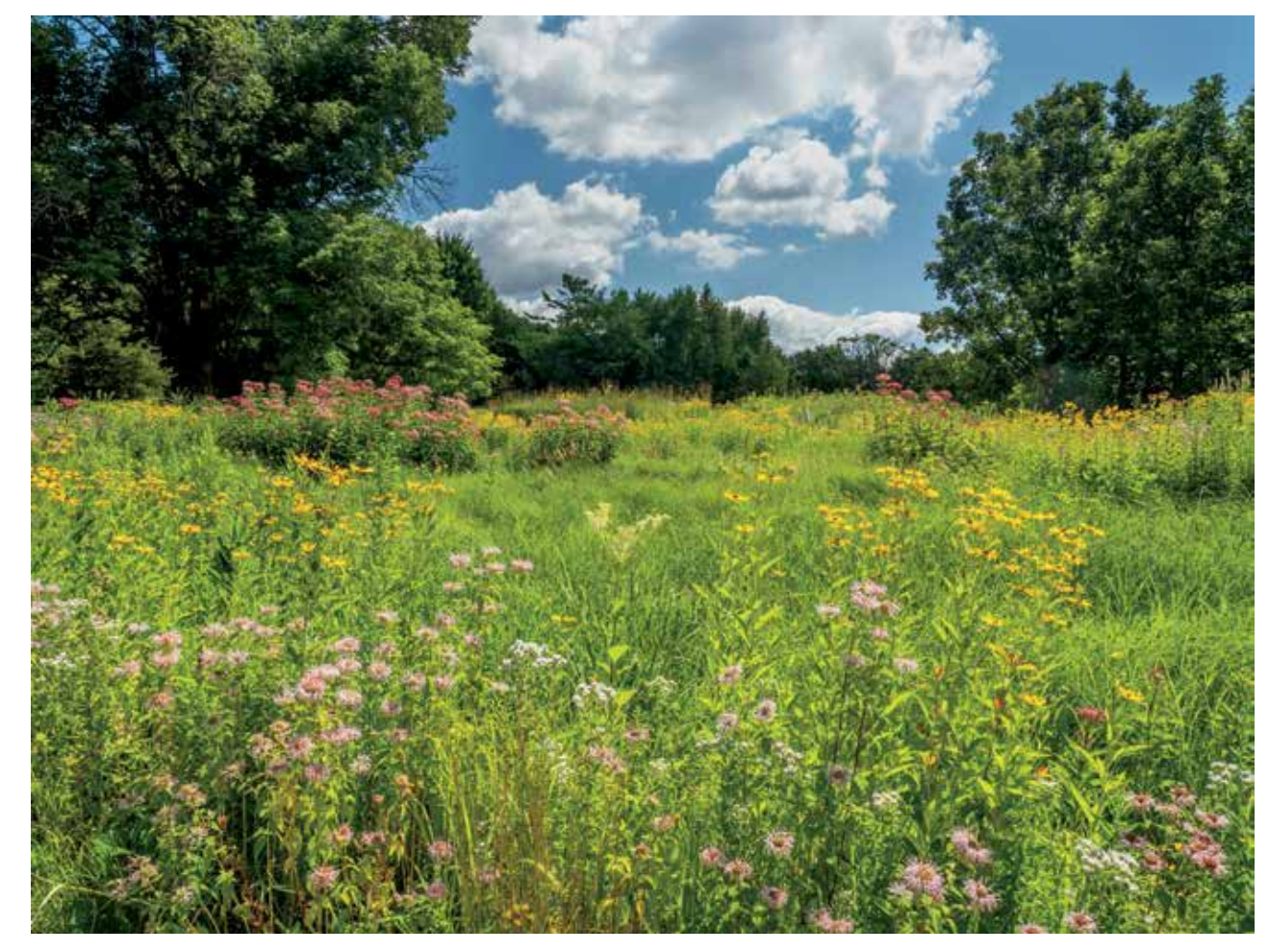
Central vista, Native Plant Garden, UW Arboretum, showing wetland, mesic prairies, bur oak savanna (right), black oak savanna (left), and oak-hickory forest.

eloquently expresses this process of education, noting that "our ability to perceive quality in nature begins, as in art, with the pretty. It expands through successive stages of the beautiful to values as yet uncaptured by language."<sup>2</sup> For me, the next step involved thinking about the processes that led to patterns: microenvironmental differences, varying means of reproduction, plant migration, competition, and succession.