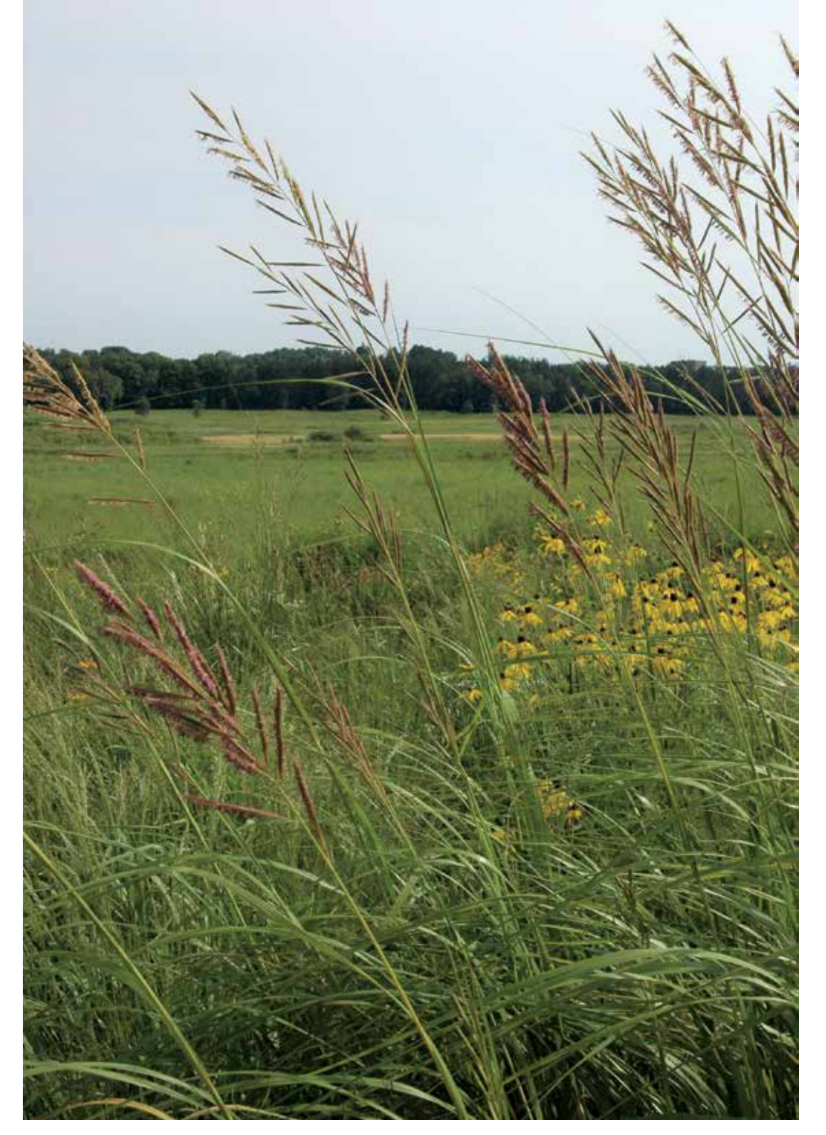
Prairie cordgrass with yellow coneflower in the wet-mesic prairie section, Native Plant Garden, UW Arboretum.