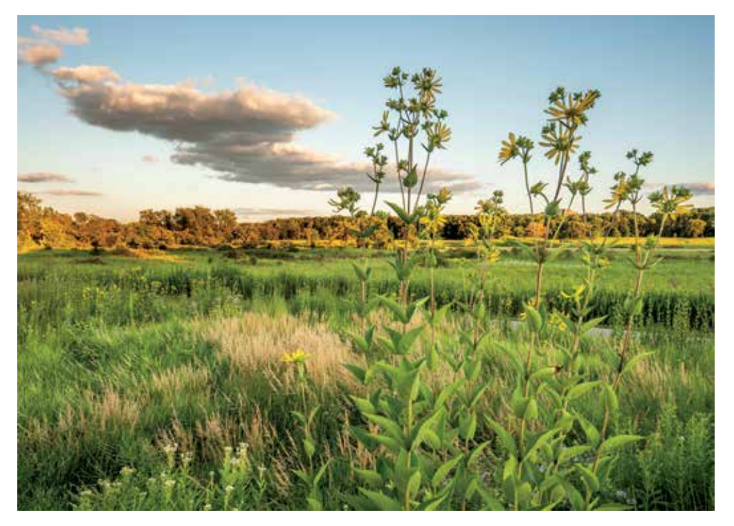
Mesic prairie section with Curtis Prairie beyond, Native Plant Garden, University of Wisconsin-Madison Arboretum.